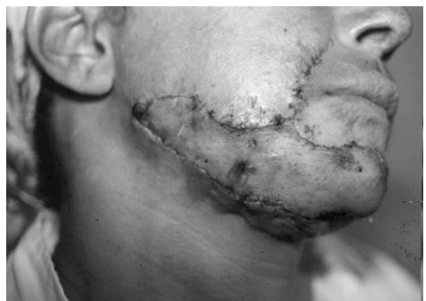
Fig. (2-B): Early postoperative view after 20 days.