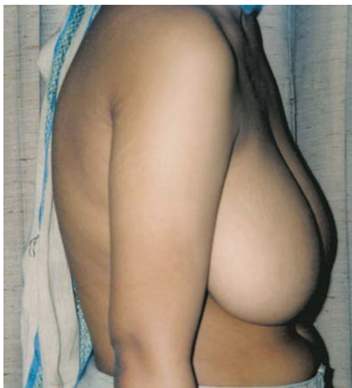
Fig. (3-C): Preoperative photograph "right lateral view" showing severity of breast ptosis with back kyphosis.