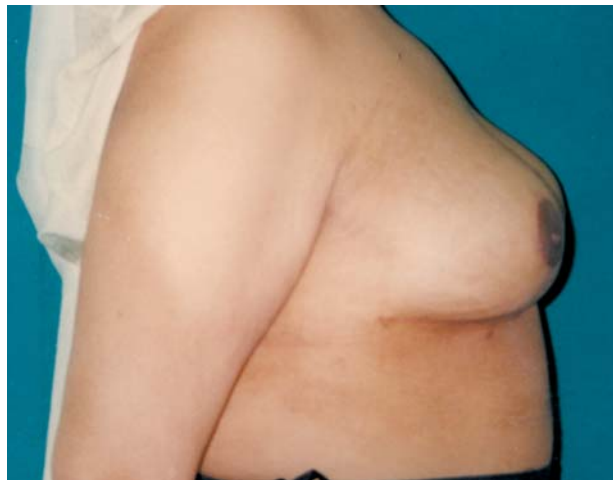
Fig. (4-D): Postoperative photograph showing correction of the presenting problems with upper pole fullness.