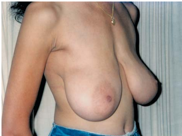
Fig. (2-C): Preoperative photograph "right oblique view" of the same patient.