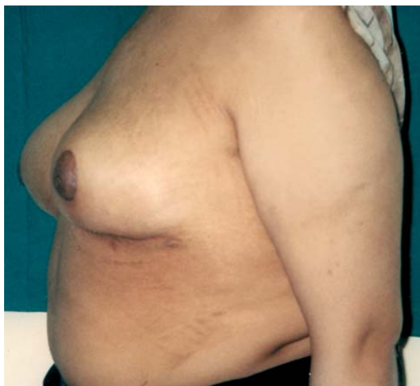
Fig. (4-F): Postoperative photograph good breast size and projection.