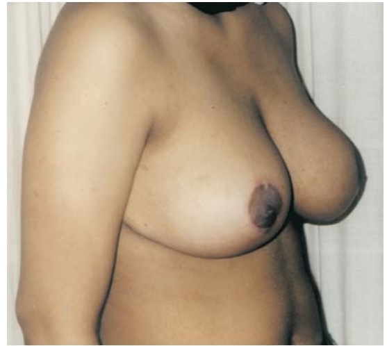
Fig. (3-D): Postoperative photograph showing good protection with correction of both ptosis and back kyphosis.