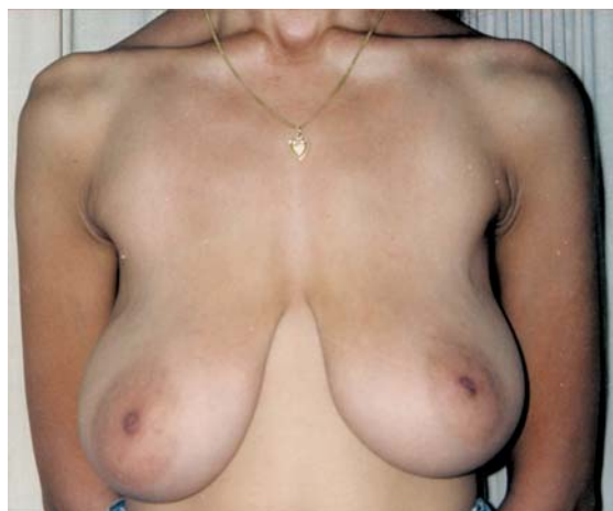
Fig. (2-A): Preoperative photograph "antero-posterior view" of a young lady showing 2 nd degree of breast ptosis with flattened upper breast poles.