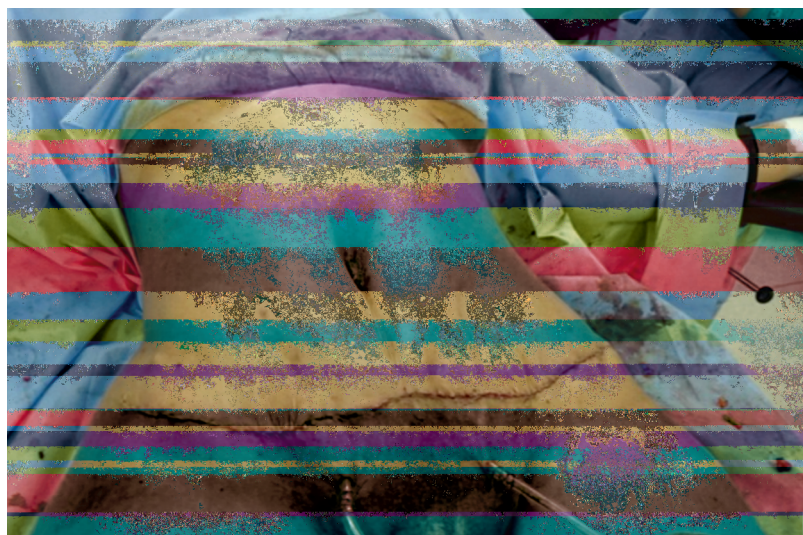
Fig. (1): A 44-year-old female patient with mild divarication of the recti. (Left) Preoperative markings with the patient on the operating table. (Right) Intraoperative view: The abdominal flap is raised with midline plication of the recti and advancement of the external oblique muscles. The hemostat is pointing to the edge of the right external oblique muscle which is about 5cm from the umbilical stalk. (Below) Immediate postoperative result after completion of the procedure with better waist definition.