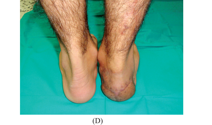
Fig. (2): A, Right heel ulcer following trauma to the foot and heel skin necrosis. B, After wound excision. C, The flap is rotated 180 degrees to cover the heel. D, 10 months postoperative with good functional and aesthetic outcome.