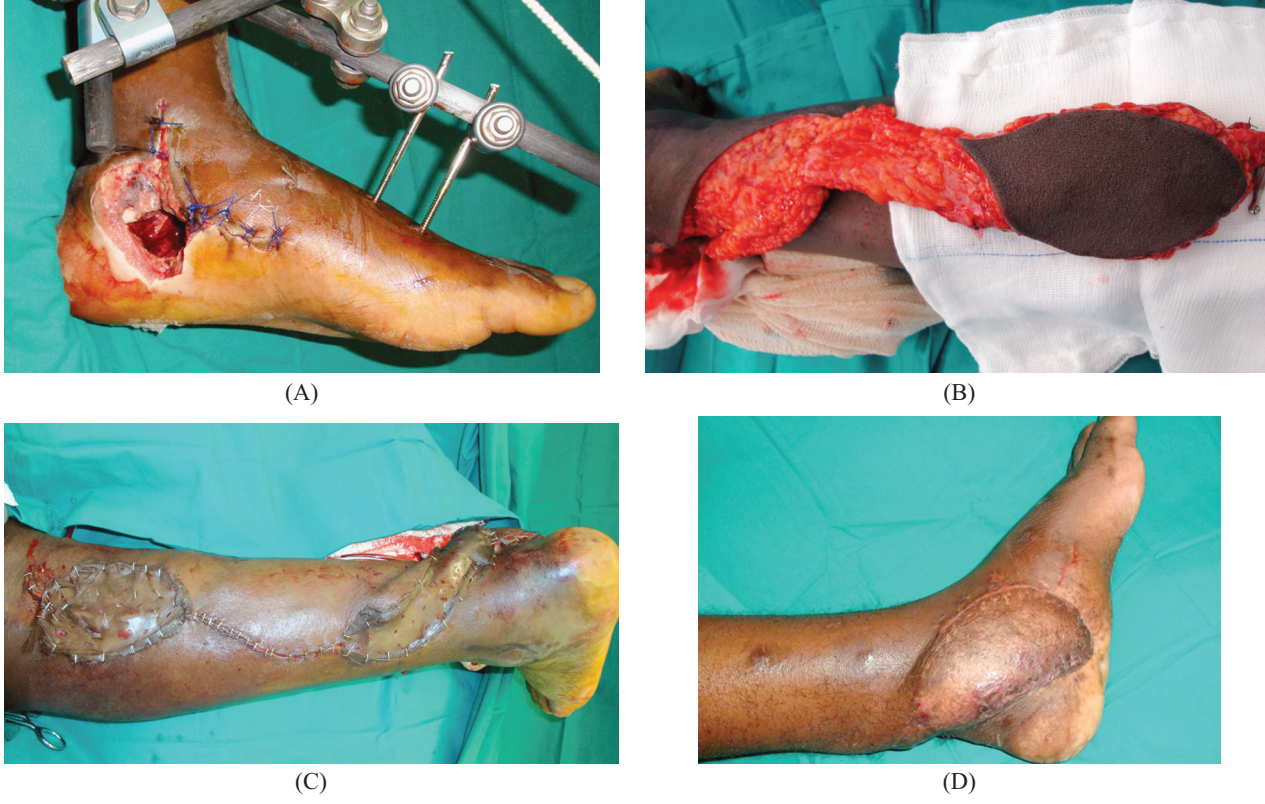
Fig. (1): A, Preoperative view showing a soft tissue defect of the medial surface of the left ankle. B, Reversed sural flap with wide fascial pedicle. C, Immediate postoperative view after skin grafting of the flap donor site and the fascial pedicle. D, Four months postoperative with stable wound coverage.