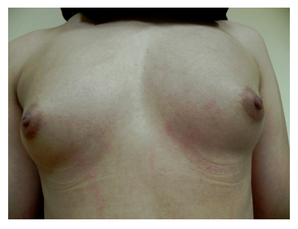
Case (1E): Post operative anterior view.