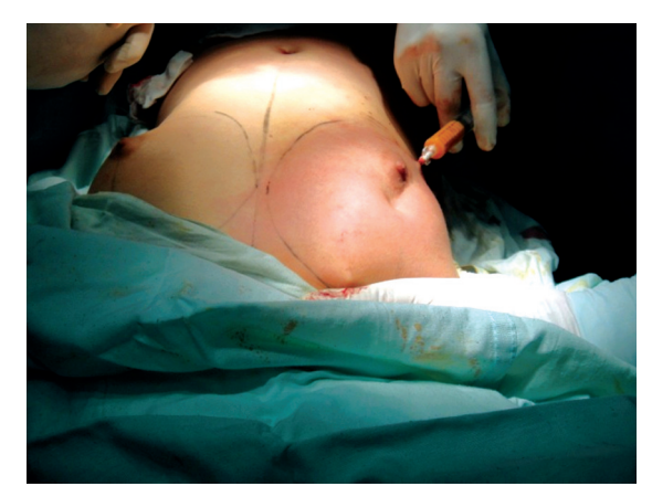
Case (2C): Intra operative photo.