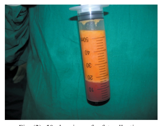
Fig. (2): 50ml syringes for fat collection.

6 patients who had undergone aesthetic augmentation were evaluated for volume since they presented too many individual factors after implant removal or reconstruction.