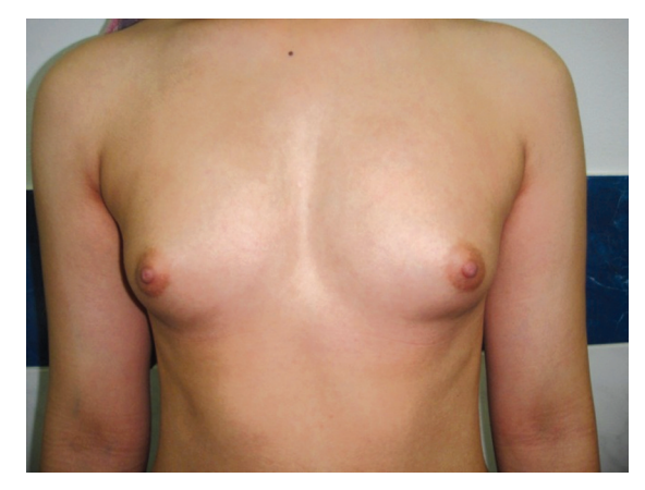
Case (2F): 3 months post operative.