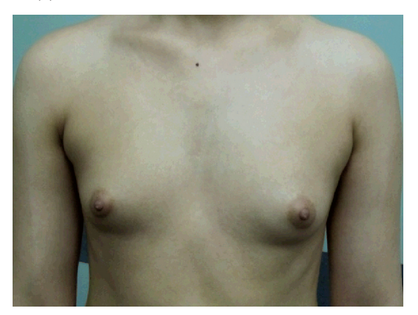
Case (1A): Pre operative anterior view.