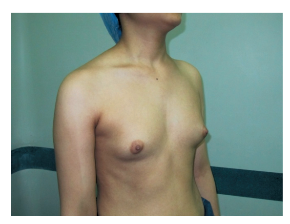
Case (1B): Pre operative photo oblique view.