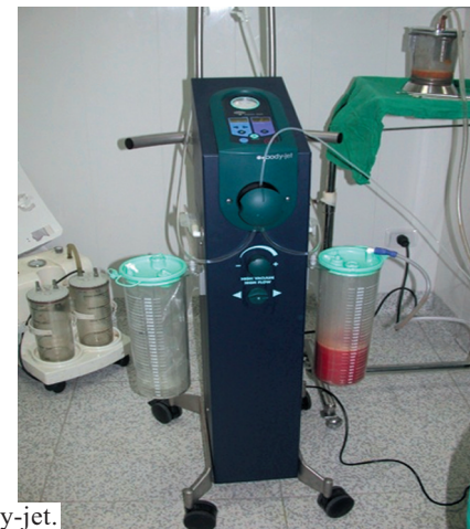
Fig. (3): The body-jet.

In the second intervention it is easier to inject more volume of fat due to now-existing expansion of the receiving site.