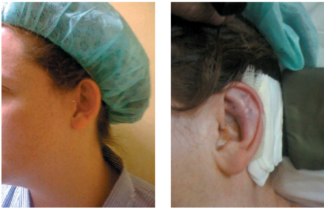
Fig. (1): Before and intraoperative.