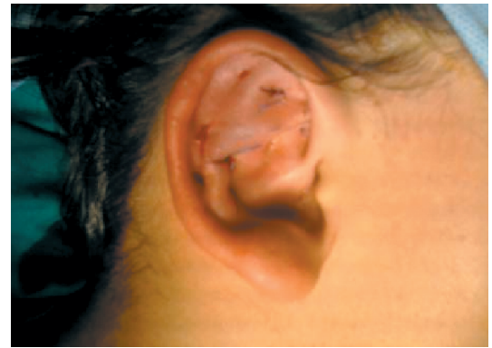
Fig. (2): Transcutaneous sutures.