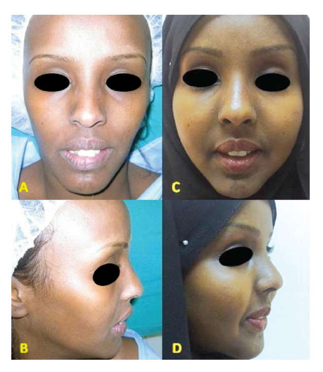
Fig. (4A,B): Front and profile views of 33-year old female patient with profound long face deformity. C and D The front and profile views 1 year after contouring the face by lipofilling.