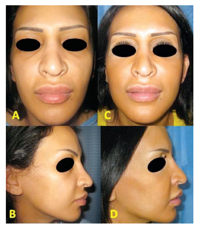
Fig. (3A,B): Front and profile views of 28-year old female patient with long face deformity. C and D The front and profile views 1 year after lipofilling of the face.