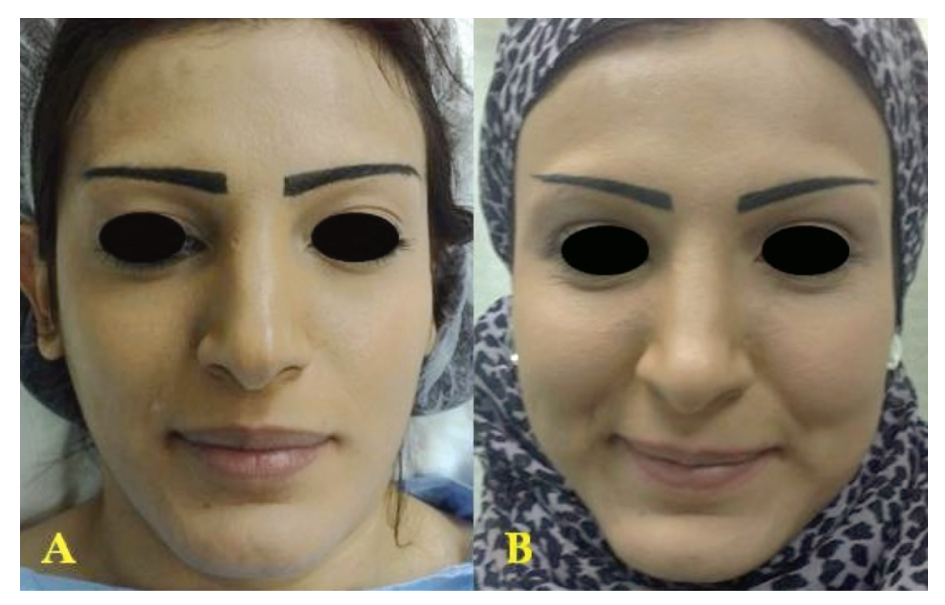
Fig. (7): Front view of long face deformity of 26-year old female patient. B The front view 1 year after contouring of the face by lipofilling.