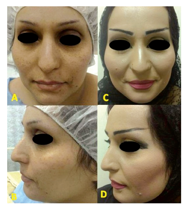
Fig. (6A,B): Front and profile views of 35-year old female patient with long face deformity. C and D The front and profile views 1 year after contouring the face by lipofilling.