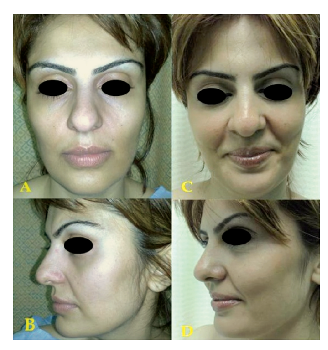
Fig. (5): Front and profile views of 31-year old female patient with long face deformity. C and D The front and profile views 1 year after contouring the face by lipofilling.