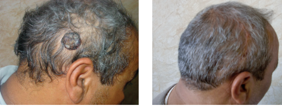
Fig. (13): Nodular BCC of the scalp and 2 years after excision and reconstruction by rotational flap.