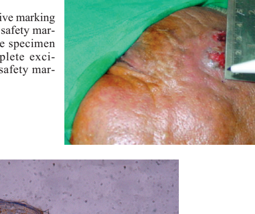
Fig. (1): Intraoperative marking with 5mm safety margin and the specimen after complete excision with safety margin.