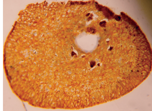
Fig. (3): Heterogenous strong (2+ -3+) cytoplasmic immunoexpression of Ezrin is exhibited by the tumor sheets of basal cell carcinoma (IHC, Original magnification X200).

Fig. (2): Immunohistochemical expression of Ezrin in normal skin shows weak positive (1+) membranous pattern of staining and the intensity of staining decreases from the basal layer towards the upper layers (IHC, Original magnification X100).