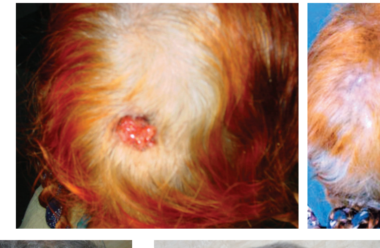
Fig. (12): Ulcerative BCC of the scalp and one year after excision and reconstruction by rotational flap.