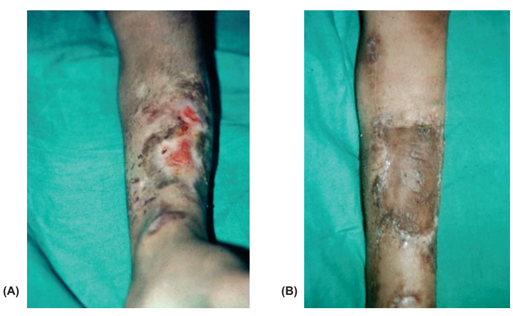
Fig. (5): (A) Unstable scar of middle 1/3 leg with tibial exposure. (B) Stable cover with island soleus with overlying skin graft.