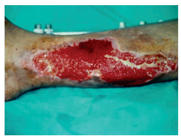
Fig. (6-B): The island soleus muscle covering the defect completely before skin grafting.