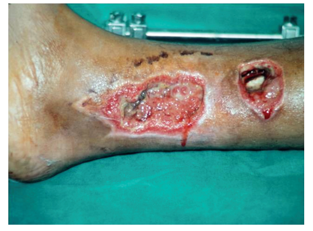
Fig. (6-A): Osteomyelitis and exposure of lower 1/3 leg and medial malleolus.