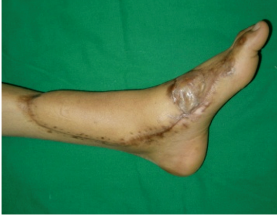
Fig. (2-D): Late postoperative with good cover of the lower third leg and ankle joint (lateral view).