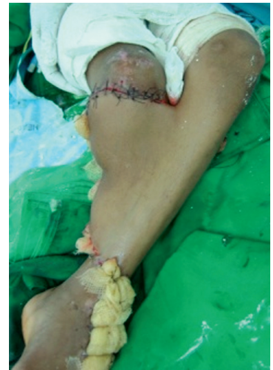
Fig. (1-B): In first stage distal part of the flap is spread and left attached distally to prevent flap retraction.