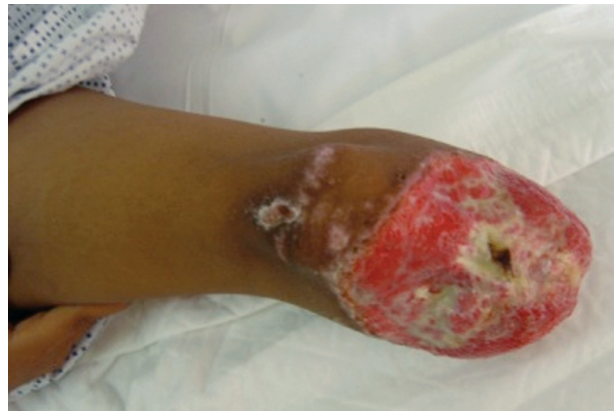
Fig. (3-C): Preoperative lateral view of the amputation stump.