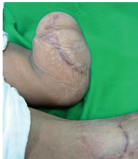
Fig. (3-D,E): Postoperative good cover of the amputation stump.