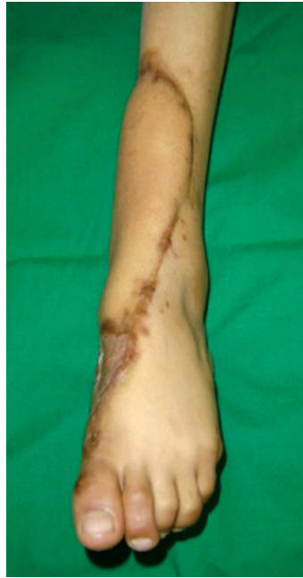
Fig. (2-E): Postoperative with good cover of the lower third leg and ankle joint (P-A view).