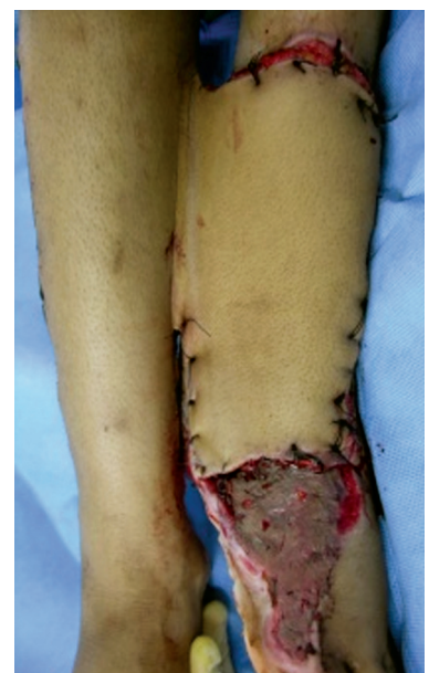
Fig. (2-C): Cross leg flap with staged division after 1 week. The hanging part of the flap is now in good contact with its bed.