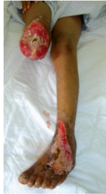
Fig. (3-A): Exposed below knee amputation stump of right leg.