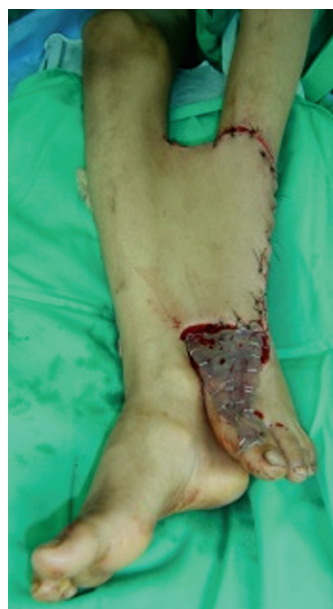
Fig. (2-B): Lower half of the flap attached to the distal point of the defect to prevent its retraction, the medial part of the distal half of the flap is left hanging with no contact.