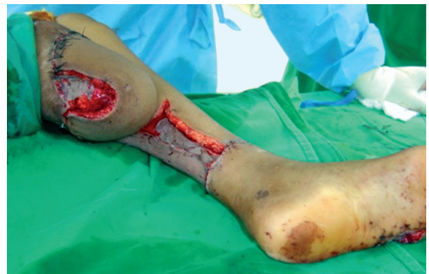
Fig. (1-D): Flap covering anterior, posterior surface and the tip of below knee amputation stump.