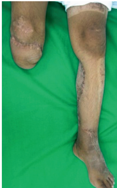
Fig. (3-B): Below knee amputation stump after reconstruction by staged division of cross leg flap.