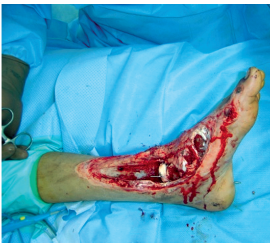
Fig. (2-A): Post traumatic exposed lower 1/3 leg, ankle and tarsal bones, notice an eaten part of the articular cartilage of ankle joint with tip of K-wire fixation.