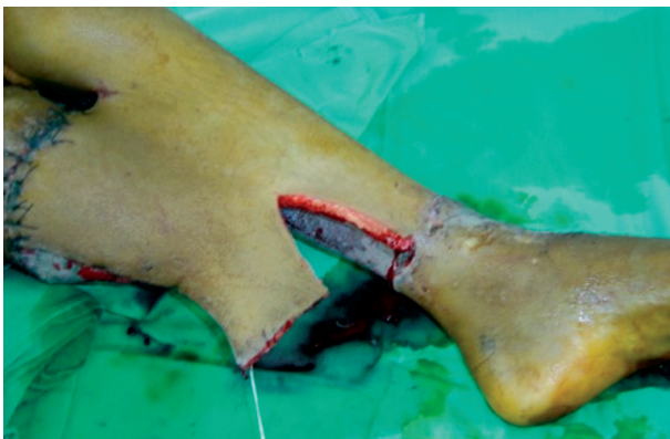
Fig. (1-C): Staged division of flap after 1 week, creating a random pattern flaps (width to length ratio 1:1).