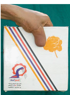
Fig. (6): The precision function (the patient can hold the key).