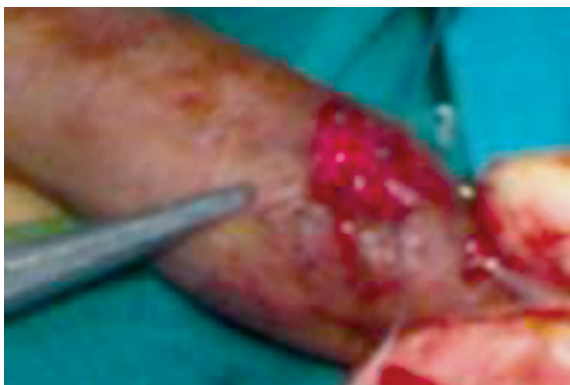
Completion of proximal anastomosis