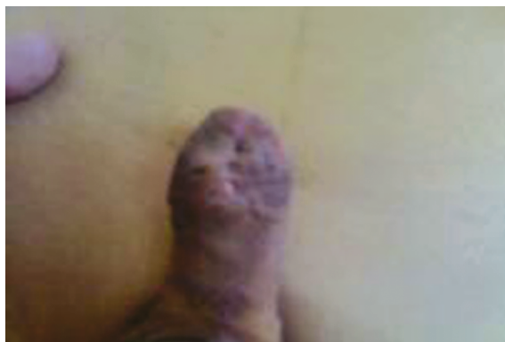
Post operative 6 months