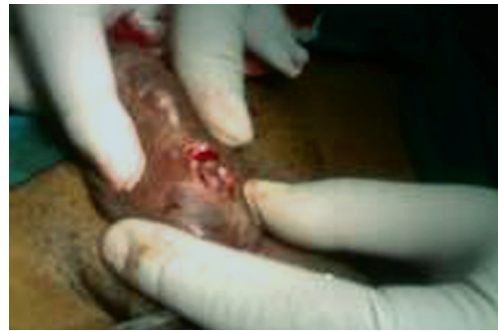
Freshening of the edge