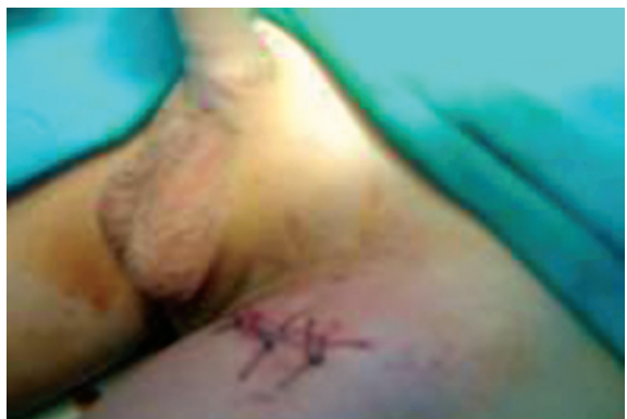
Wound closure after vein graft