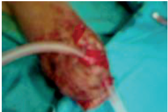
The vein graft inset in place