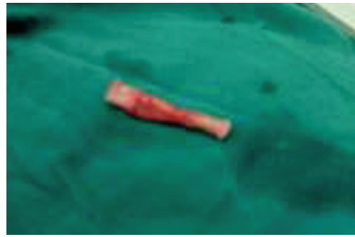
Vein graft after harvesting