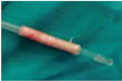
Vein after dilatation