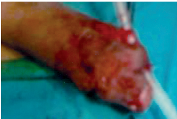
Completion of distal anastomosis