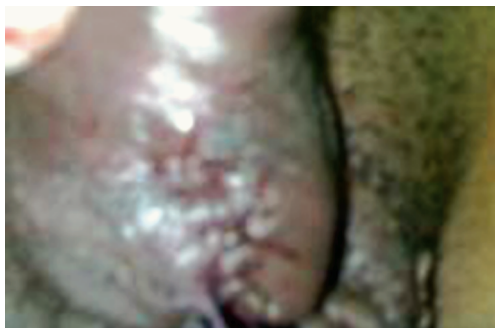
Closure of outer layer