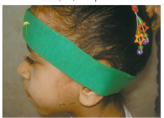
Case (2-B): Sweat hand-band.