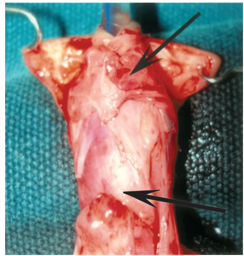
Fig. (5): The broad distal part of the flap is folded and fixed to the glans wings around the neometaus (black arrow). The proximal part is fixed to Buck's fascia up to the normally developed urethra (white arrow). Well-vascularized tissue completely covers the neourethra.