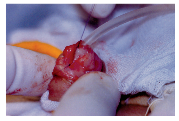
Fig. (2-C): After closure of the urethroplasty.