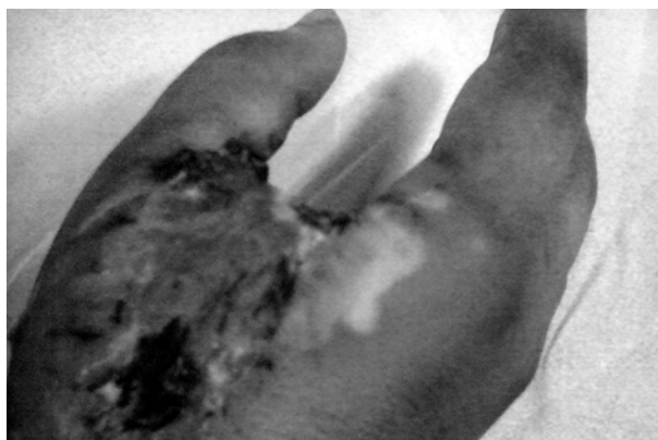
Fig. (3-B): Reconstruction of the first web space by ultra-thin abdominal flap. The flap completely survived with good contour and not bulky.