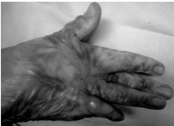
Fig. (1-A): Postburn scarring and contracture deformity of the right hand with flexion deformity of the little finger.

Thirty soft tissue defects in the hand and forearm were reconstructed by ultra thin abdominal flap. All flaps had complete survival at the time of division. One flap had distal necrosis involving two centimeters that needed debridement and re-suture to the edge of the defect. One flap had disruption that needed secondary sutures. All flaps gave a satisfactory coverage with excellent contouring (Figs. 1,2,3).