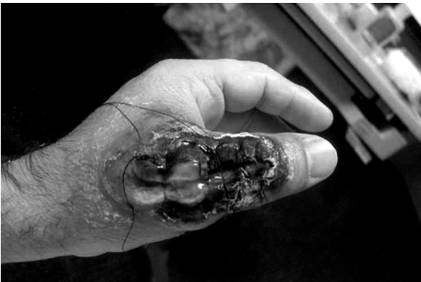
Fig. (2-A): Posttraumatic soft tissue defect on the dorsum of lift thumb.