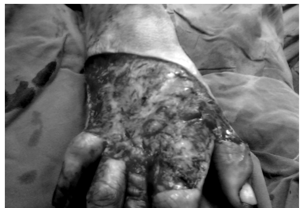
Fig. (1-B): Excision of the burn scar and release of the contracture.