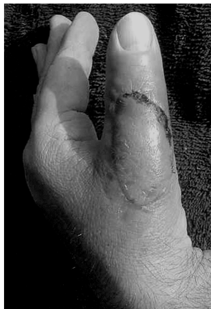
Fig. (2-C): The flap completely survived. The flap is not bulky and has a good contour.