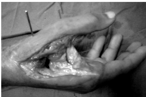
Fig. (3-A): 23-year old patient with a soft tissue defect after release of contracted first web space.