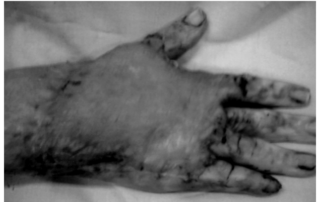
Fig. (1-F): The flap is thin and completely survived.