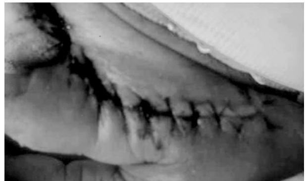
Fig. (2-B): Coverage of the defect by ultra-thin abdominal flap.