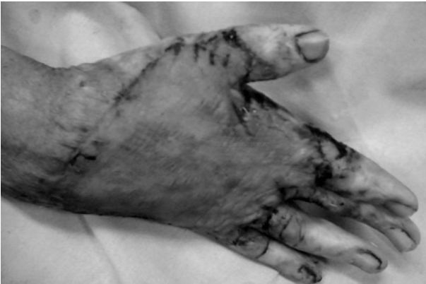
Fig. (1-E): Postoperative view of the hand after division of the abdominal flap.