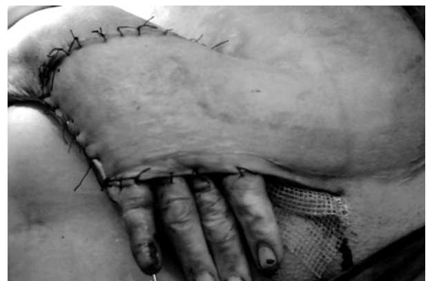
Fig. (1-D): Coverage of the hand by the abdominal flap and fixation of the little finger in extension by K-wire.