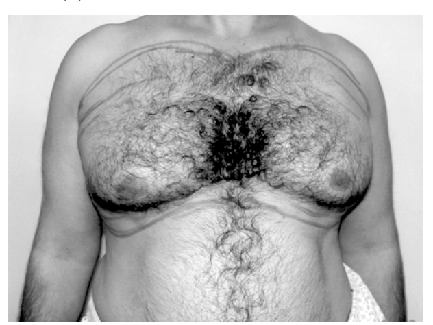
Fig. (1-A): Preoperative view of 42-years old patient with grade IIa gynecomastia and it shows the markings for liposuction.

An algorithm for surgical treatment of all grades of gynecomastia is reached following retrospective analysis of the studied cases. This is shown in Table (2).