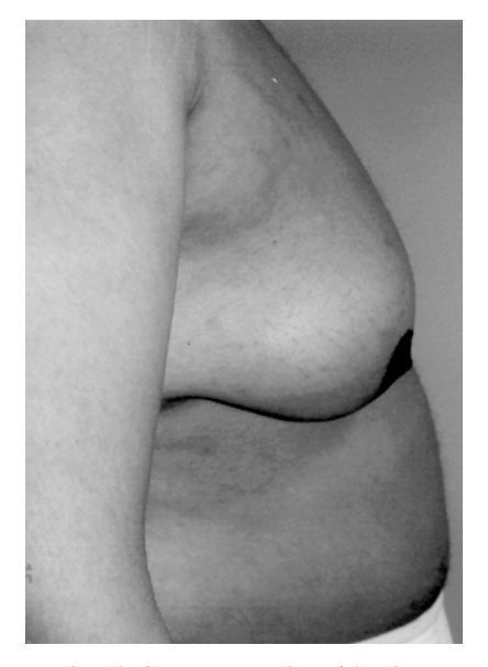
Fig. (2-C): Preoperative side view.