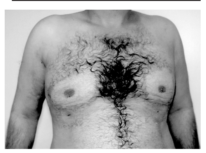
Fig. (1-B): Postoperative view after one week. The patient underwent liposuction and glandular excision.