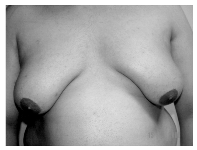
Fig. (2-A): Preoperative view of 27-years old patient with grade III gynecomastia.