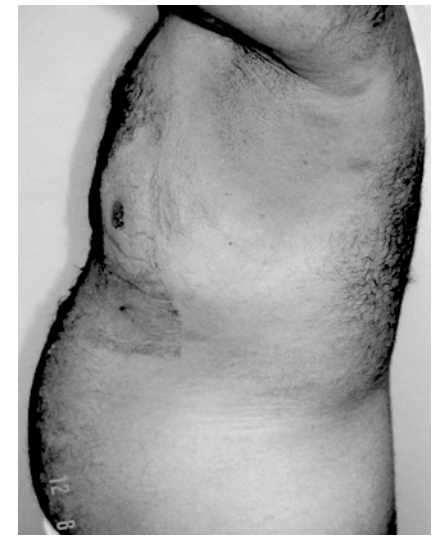
Fig. (1-D): Post-operative side view.